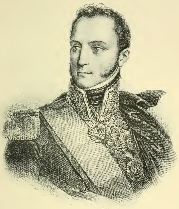
CAULAINCOURT DUC DE VICENCE